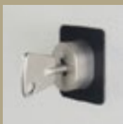
DRAWER KEY LOCK

Chubbsafes Fire File 31" models are fitted with high-security locks as standard. They can be equipped with a central key lock for single locking or together with a mechanical combination lock for dual central locking. In addition each individual drawer can be fitted with a key lock.